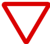
(1) GIVE WAY

Q.2. Traffic signs form the most commonly found examples of the triangle in our everyday life. Some of the traffic signs are given in the following figures.