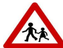
(4) SCHOOL AHEAD